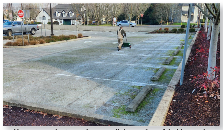
Use a spreader to apply a very light coating of baking soda directly on moss growth using a spreader.

Is your pervious concrete turning green? Stop moss growth now, before it gets too thick. Do it yourself by applying a light dusting of sodium bicarbonate (baking soda) wherever green moss is visible. This kills moss within hours and often keeps your pavement moss-free the entire winter. Don't wait until it is so thick that it requires removal by pressure washing. If you do prefer professional pavement cleaning, please contact us.