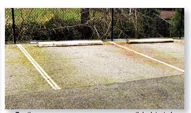
Treating moss-prone areas as soon as growth is detected reduces volume and the need for heavy duty cleaning.