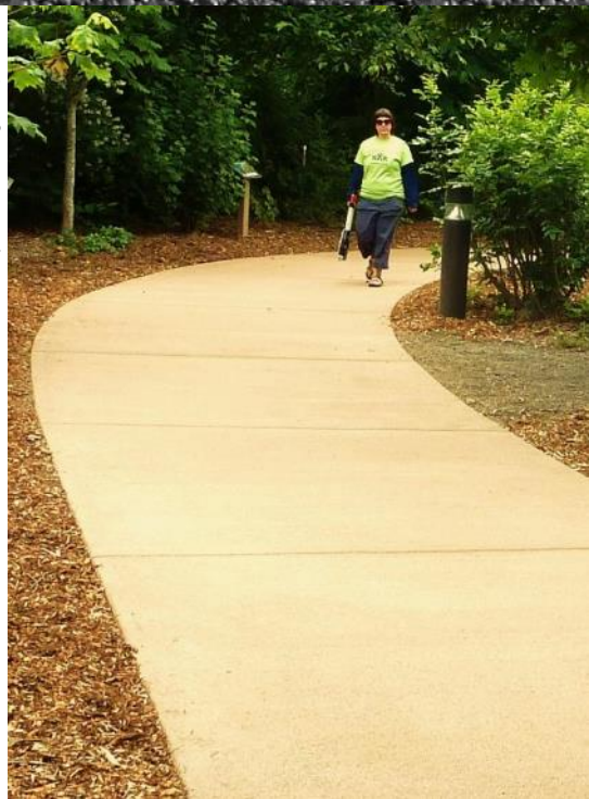
Jackson Bottom Wetland Hillsboro, Oregon

This project used three-inches of standard 3/8" pervious as the base and one (1) inch of "Sandstone" tinted WalkWay™ on top. Only the overlay required color. The two pervious mixes bond and drain well together.