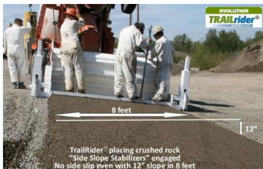
TrailRider placing crushed rock "Side Slope Stabilizers" engaged No side slip even with 12° slope in 8 feet

Evolution Slipform pavers are designed to pave to the grade. Controlling grade is tricky when paving over loose base rock used for pervious pavements. Our removable rock screed reduces pressure to the grade skids and aids depth control. Minor ruts and inconsistencies in the aggregate are leveled by this screed.